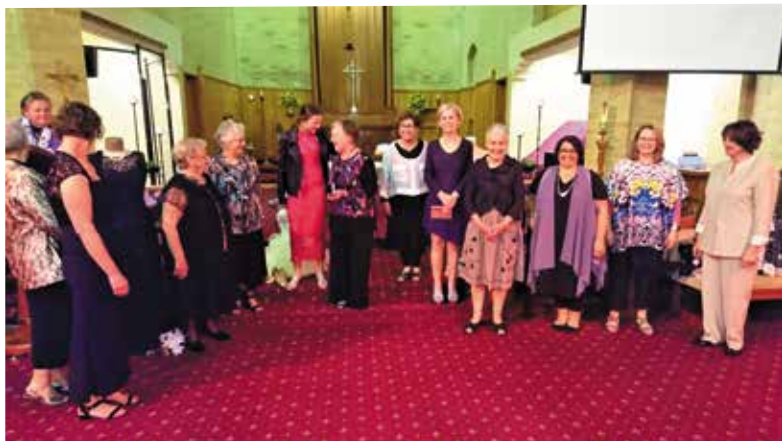
"Angel mannequins" at St Peter's Leongatha