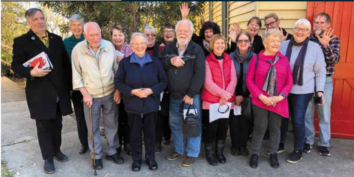
Diocesan Retreatants on Raymond Island