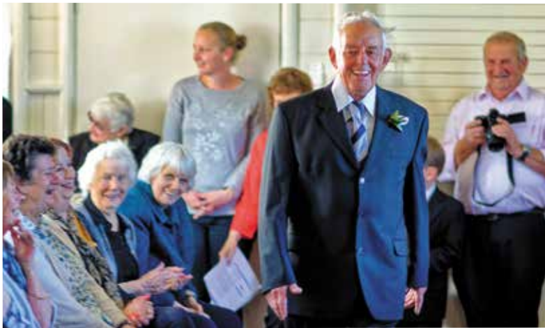
Modelling "Father of the bride"

With over 100 people present, the event was deemed to be such a success that the organizers are already planning a bigger and better show next year.