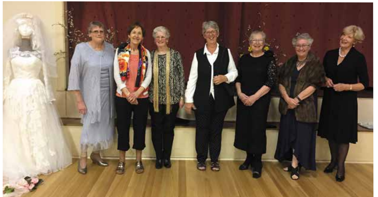
Models at the Korumburra-Poowong Fashion Parade