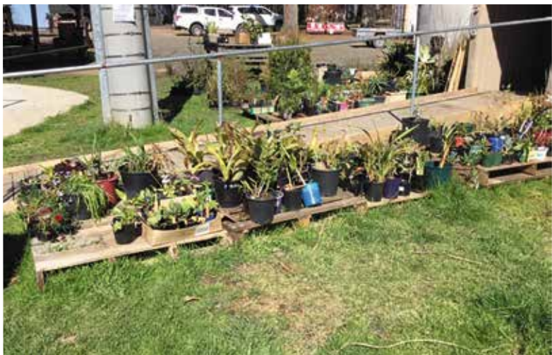
Plants for re-establishing gardens after the bushfires

We are grateful to our guest speakers who were very informative. The afternoon was finished with drinks and a table full of tasty delights.