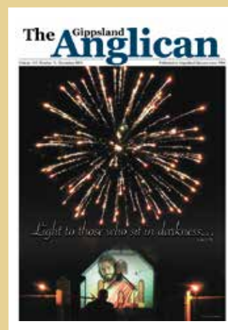
The winning image on TGA's December 2018 cover

TGA wins gold twice at the Australasian Religious Press Awards: Best Regional Publication and Best Original Photography for last year's Christmas cover image by the Rev'd Chris Macaleer. (See page 4)