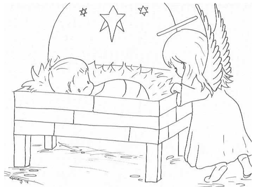
Nativity blackline master by Kate Spalding