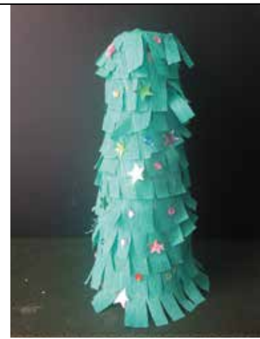
Christmas tree made from cardboard or polystyrene cone