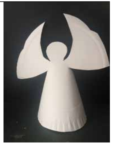
Angel made from paper plate