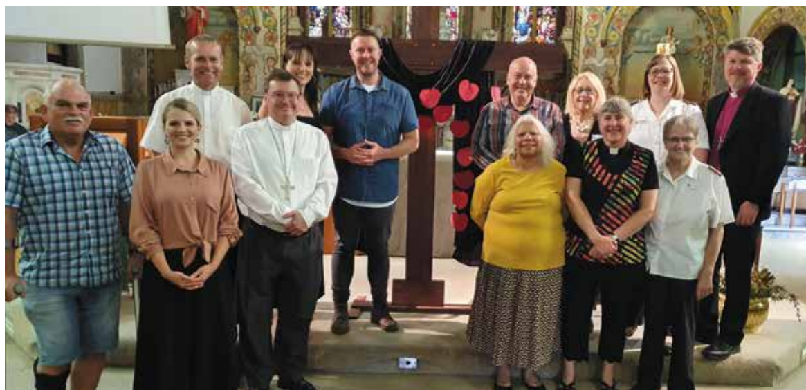
The Christian ministry team at St Mary's Catholic Church in Bairnsdale

This moving, uplifting and inspiring service granted desperately needed comfort and strength and courage to continue, not faltering in our faith. Playing no small part in delivering said strength were the wonderful volunteers of both Rotary and Lions clubs who provided and cooked a hearty barbecue dinner for the convivial, after-service gathering on the forecourt of St Mary's. From there we went in peace to love and serve the Lord.