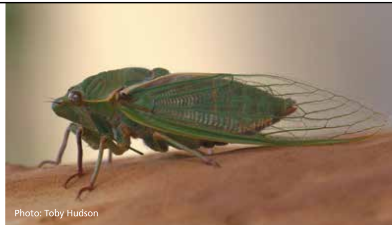
The 'green grocer' cicada ( Cyclochila australasiae ) is a food source for insect-eaters in east Gippsland

"This is the time people are directly affected. It's pretty